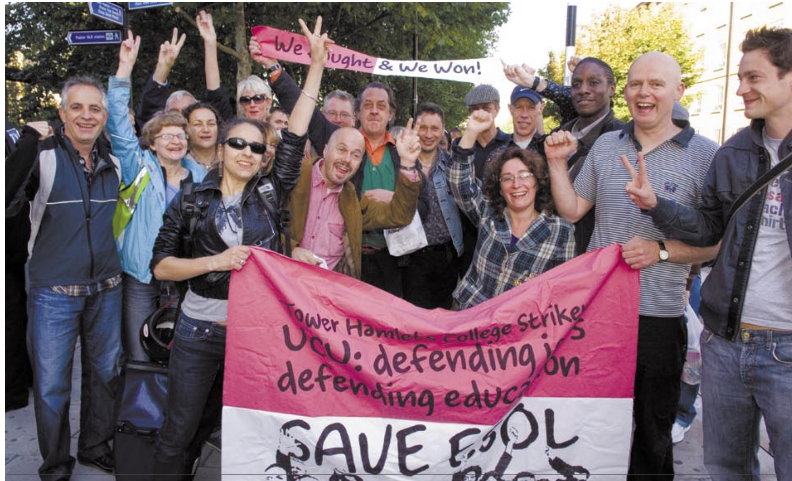
Tower Hamlets College UCU members celebrate after their victorious all-out strike to defend jobs and education. Determined action stopped compulsory redundancies, halted cuts to course hours, and won a range of further concessions.

Likewise the National Pensioners Convention has called